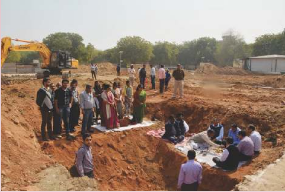
An auspicious beginning for the construction of the new college building. The 'bhoomi puja ceremony'.