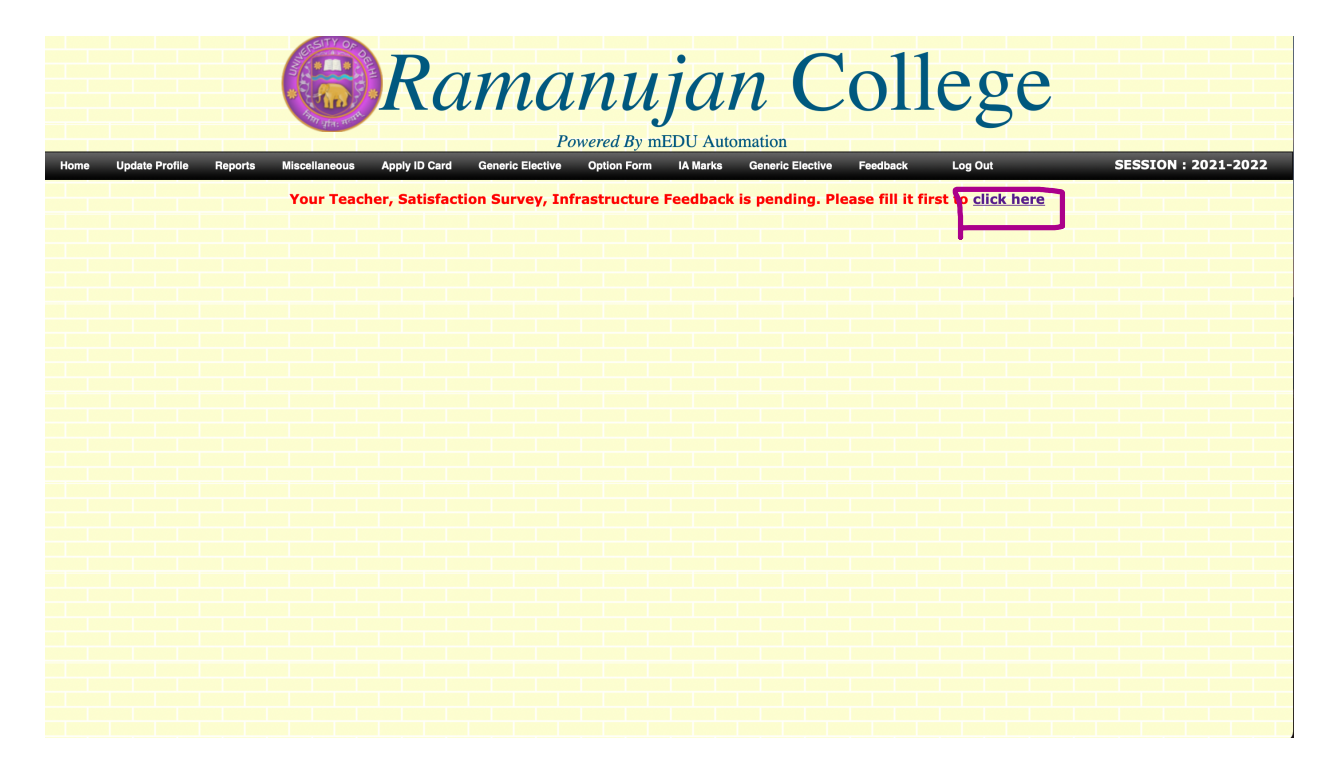
Step 5: Click to fill all three feedback: