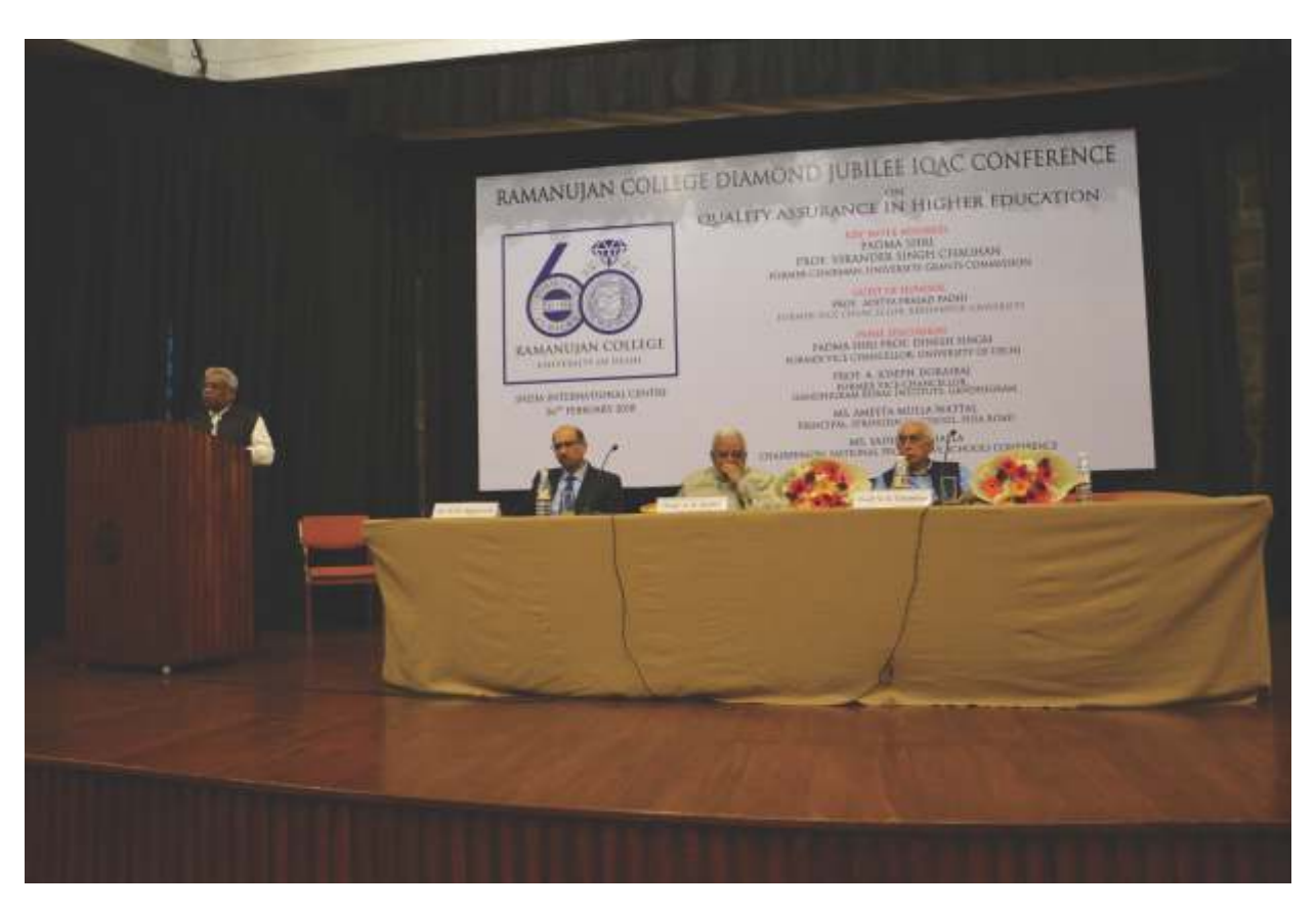
Internal Quality Assurance Cell (IQAC) Conference on "Quality Assurance in Higher Education"