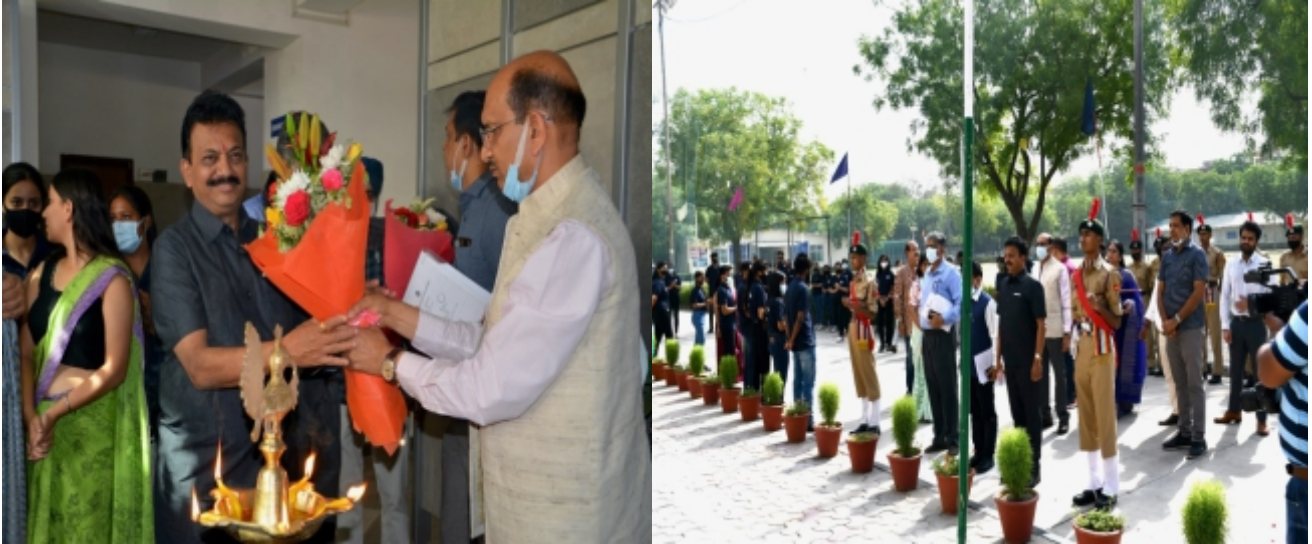
College Principal and NCC cadets greeting NAAC members